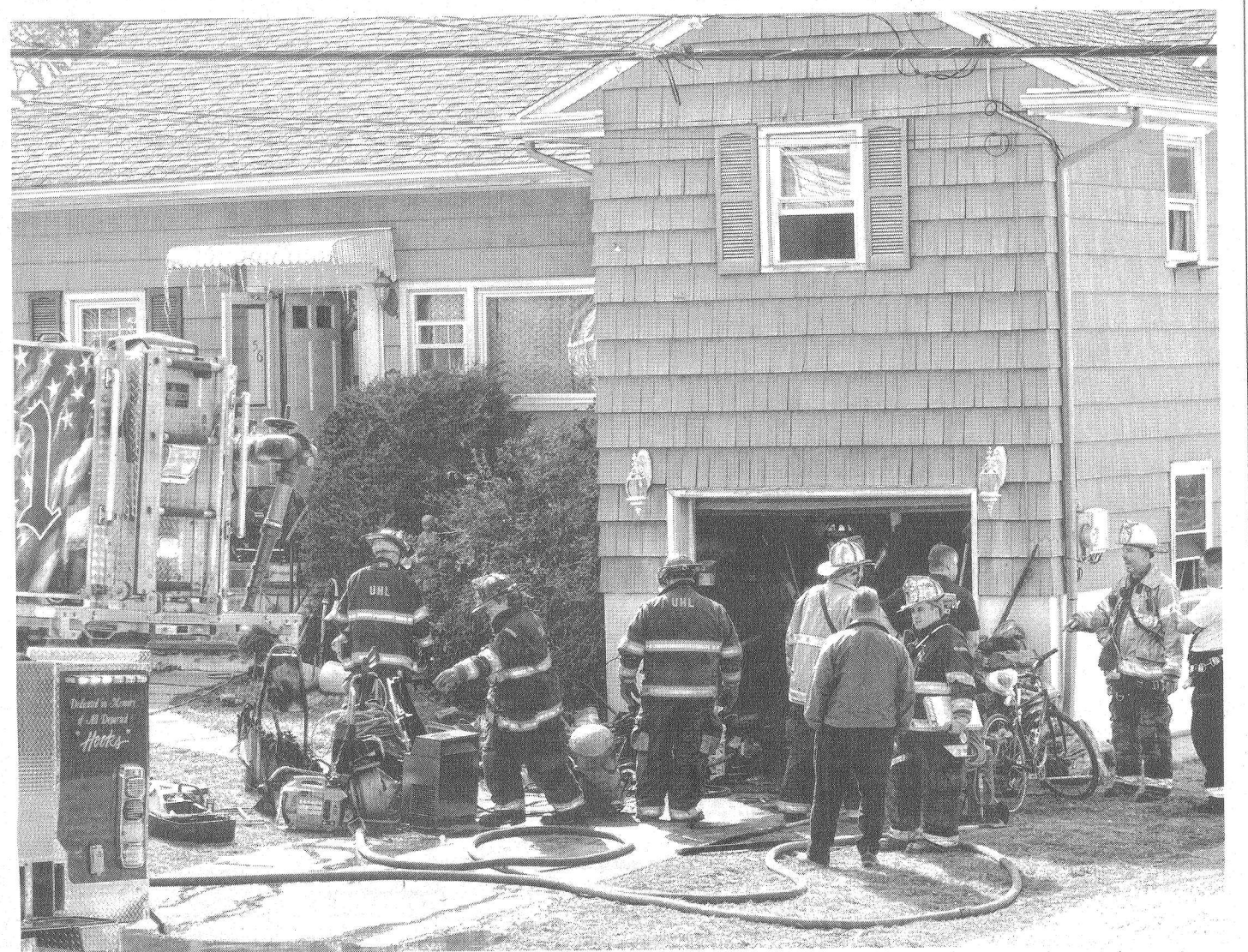
Mount Kisco firefighters quickly doused a garage fire at 56 Woodland St. on Friday, keeping flames from spreading to the attached house. The fire was reported about 2:15 p.m. No injuries were reported. More photos at lohud.com.